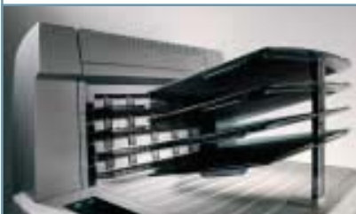
Unique sorter eliminates high-traffic bottlenecks

DRYSTAR 5503 features multiple-format handling, with the three most popular media sizes and/or types permanently on-line. The imager is thus capable of delivering CT, MRI, DSA, digital R&F, CR and DR images at high speed onto different DRYSTAR DT2 media. The DRYSTAR 5503 comes with three input trays. Every input tray can use five different film formats, ranging from 8 x 10" to 14 x 17", making the final image versatility of this stand-alone, small footprint unit remarkable. And what DRYSTAR 5503 gains in versatility, the user gains in convenience and time.