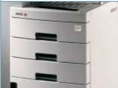
Three media trays for different on-line media sizes

The Direct Digital Imaging technology employed by DRYSTAR 5503 is not only fast, clean and environmentally friendly, it is also one of the best ways of translating the high-resolution capability of 508 ppi at a spot size of 50 \mu m to a final image. Agfa's Direct Digital Imaging technology performs well beyond current industry standards, ensuring that every pixel in the image is fully software controlled for virtually flawless and consistent image quality. A significant reduction in wear and tear is due to an equally significant reduction in moving parts as a result of using Direct Digital Imaging technology.