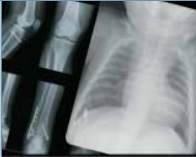
High-resolution of 508 ppi