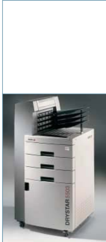
By bringing together a diversity of modalities within an appropriate user-friendly integration – sharp high resolution imaging, state-of-the-art technology, excellent media and maximum user-friendliness – DRYSTAR 5503 is well equipped to serve the multiple demands of a busy department.

As an option, DRYSTAR 5503 can also print mammography images. Using our dedicated DT2 Mammo film ensures you the highest image quality, in accordance with mammography standards. With its 508 dpi resolution and the A#Sharp technology, DRYSTAR 5503 produces the sharpest images, ideally suited for digital mammography. An automatic quality assurance tool is built in to help you with your daily quality checks. Images can be printed on 8 x 10" film, as well as on 10 x 12" film for modalities with larger detectors. As a third film size for mammography we also offer 11 x 14". In the mammography mode, the DRYSTAR 5503 can print up to 120 8 x 10" mammo films per hour, fitting easily into an environment with several modalities, while ensuring full performance for the mammography department.