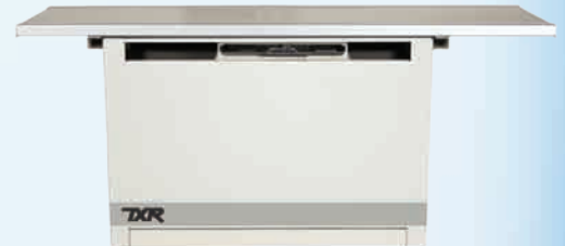
13-FBT-4WFT-E HEAVY DUTY 4 WAY FLOAT TOP TABLE

Options: — Super Speed Bucky — Various Grids — AEC