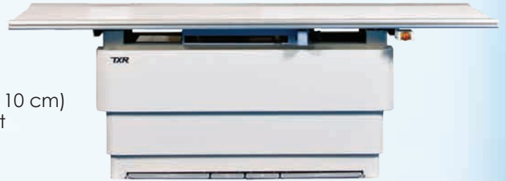
S-HL 4 WAY FLOAT TOP ELEVATING TABLE