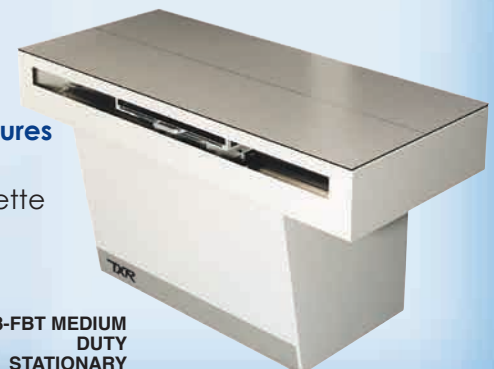
13-FBT MEDIUM DUTY STATIONARY TOP TABLE

Options: — Super Speed Bucky — Various Grids — 60" Long Table Top — 12" (30.5 cm) Drop Leaf — AEC