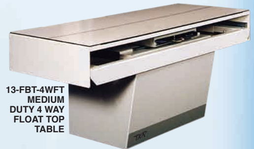
13-FBT-4WFT MEDIUM DUTY 4 WAY FLOAT TOP TABLE

Options: — Super Speed Bucky — Various Grids — 60" Long Table Top — 12" (30.5 cm) Drop Leaf — AEC