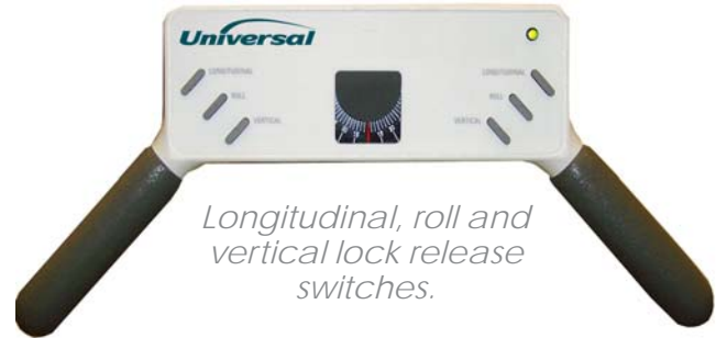
Longitudinal, roll and vertical lock release switches.