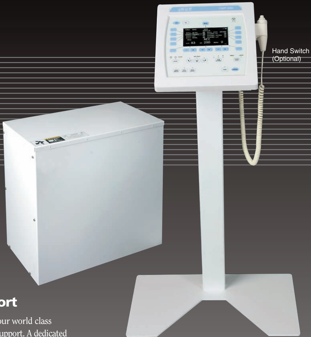
Hand Switch (Optional)