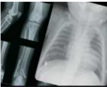
High resolution of 508 ppi