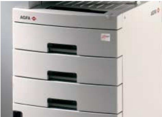
Three media trays for different on-line media sizes

DRYSTAR 5503 features multiple-format handling, with the three most popular media sizes and/or types permanently on-line. The imager is thus capable of delivering CT, MRI, DSA, digital R&F, CR and DR images at high speed onto different DRYSTAR DT2 media. The DRYSTAR 5503 comes with three input trays. Every input tray can use five different film formats, ranging from 8 x 10" to 14 x 17", making the final image versatility of this stand-alone, small footprint unit remarkable. And what DRYSTAR 5503 gains in versatility, the user gains in convenience and time.