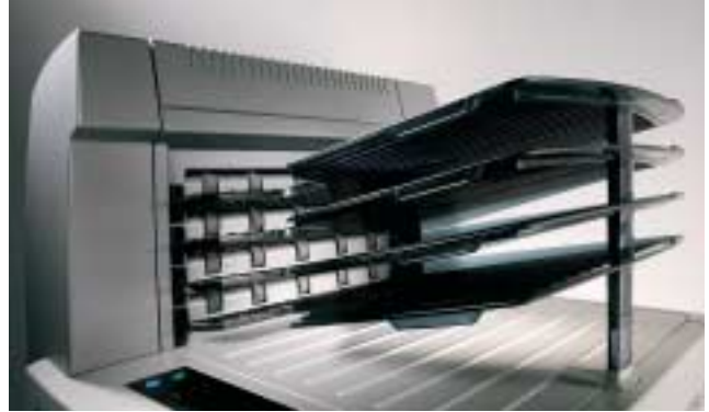
Unique sorter eliminates high-traffic bottlenecks