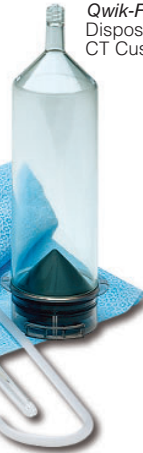
Medrad 200ml Qwik-Fit Syringe® Disposables CT Custom Kit