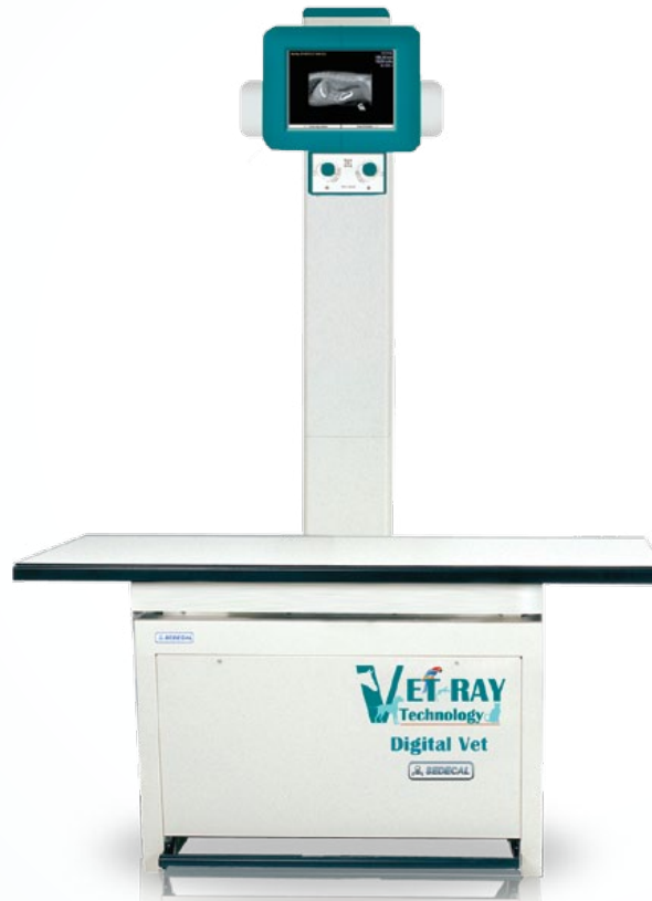
DX-C • DX-T • DX-V • DX-6